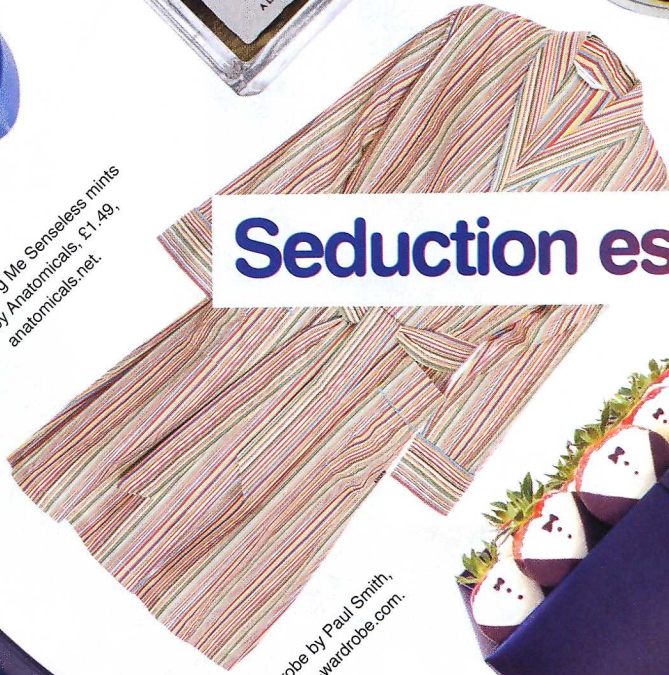
Bathrobe by Paul Smith, £84, my-wardrobe.com.