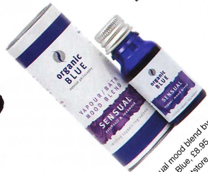
Sensual mood blend by Organic Blue, £8.95, healthqueststore.com.

Set the mood and practise the art of seduction with these sure-fire winners.