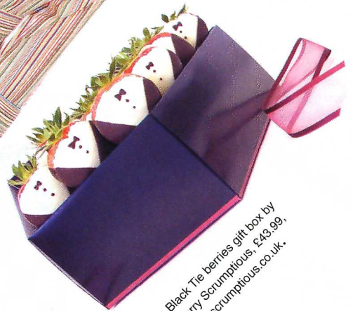
Black Tie berries gift box by Berry Scrumptious, £45.99, berrysumptious.co.uk.