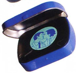
Srog Me Senseless mints by Anatomicals, £1.49, anatomicals.net.