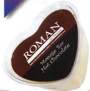
Hot chocolate message bar by Roman, £3, romanathome.com.